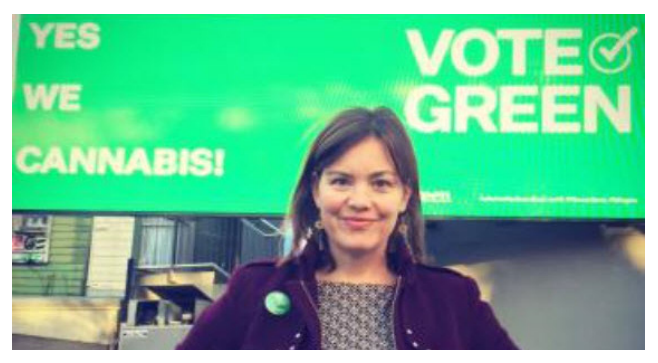
continuing a debate about the use of smoked medicinal cannabinoids." (our emphasis added)

"It is hard to justify a place for a smoked medication, in light of the serious public health harms related to smoking and availability of other methods of delivery. For this reason, the authors would not recommend